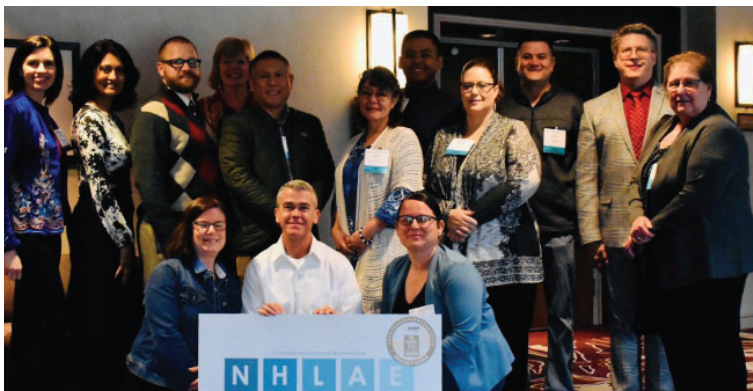
2019 graduates of the Nursing Home Leader Academy of Excellence